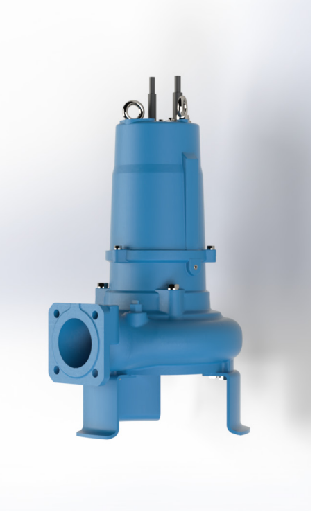
JIS Flange Compatible with Tsurumi guide rail system