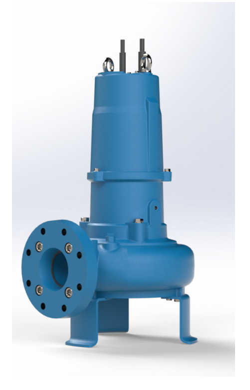
Flange Adapter Compatible with Barnes BAF-4x4 and Flygt and Zoeller guide rail systems

Tsurumi is a registered trademark of Tsurumi America, Inc. Flygt is a registered trademark of Xylem Water Solutions. Zoeller is a registered trademark of Zoeller Pump Company, LLC.