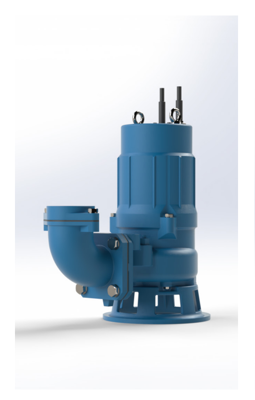
Elbow 3"NPT compatible with Barnes BAF-3030

By providing a single out-of-the box solution, this package will allow for simplified inventory, and no surprises during installation.