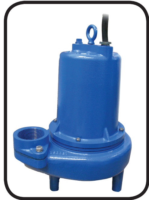
Submersible Sewage 3" Discharge, 2-1/2" Spherical Solids Manual Operation