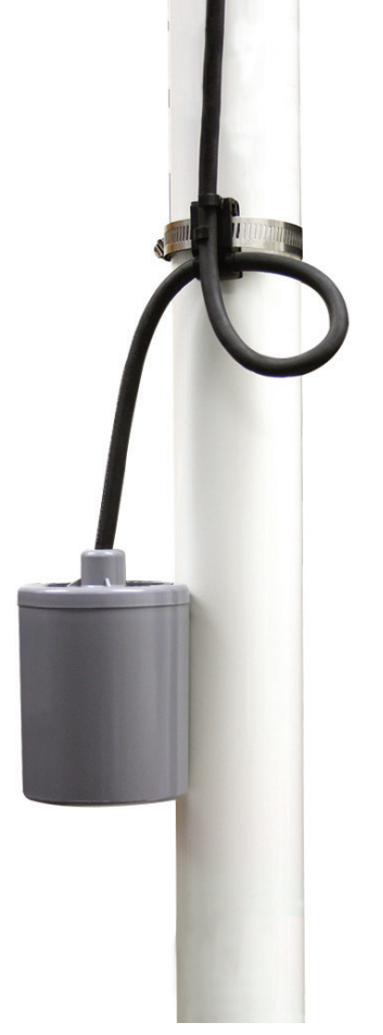
UL Recognized for Water & Sewage