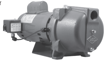
8300 Series Shallow Well

Wiring directions are given on the pressure switch.