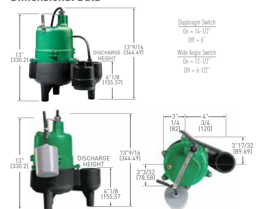
All dimensions in inches. Metric for international use. Component dimensions may vary \pm 1/8 inch. Dimensional data not for construction purpose unless certified. Dimensions and weights are approximate.