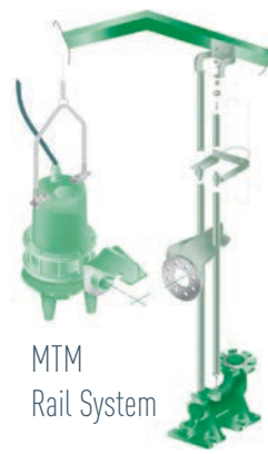
MTM Rail System