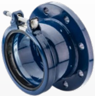
Nominal Pipe Size 3"-10"