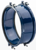
Nominal Pipe Size 12"-24"