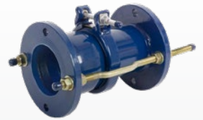
Nominal Pipe Size 3"-24"