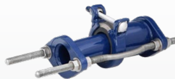
Oval Flange Nominal Pipe Size 2"