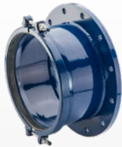
Nominal Pipe Size 12"-24"