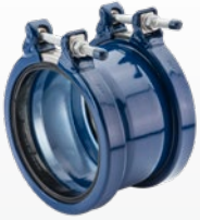
Nominal Pipe Size 2"-10"