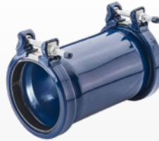
Nominal Pipe Size 2"-10"