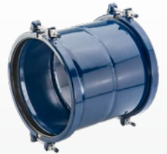
Nominal Pipe Size 12"-24"