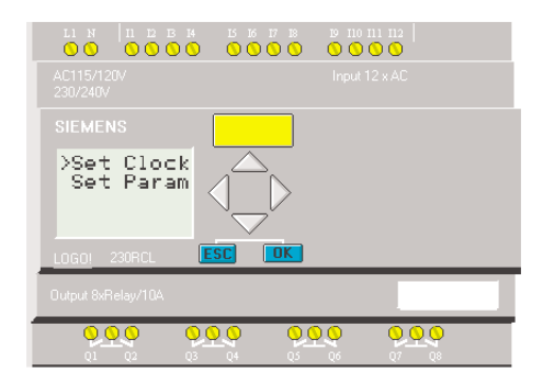
Step 2: Two options will be given. The arrow on the LCD display will point to "Set Clock." Press the "OK" key.

Step 1: The picture to the left shows the unit when it is in run mode. Press the "ESC" and "OK" keys <u>simultaneously</u> to begin the configuration process.