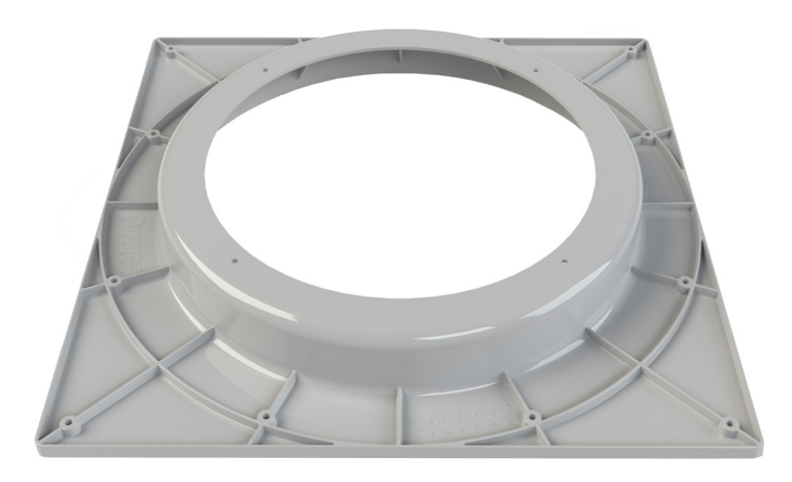
RRFTA24 Tank Adapter

Orenco RRFTA24 Tank Adapters are designed to provide a structural, watertight method of attaching access risers over tank openings in concrete tanks that don't have cast-in adapters.