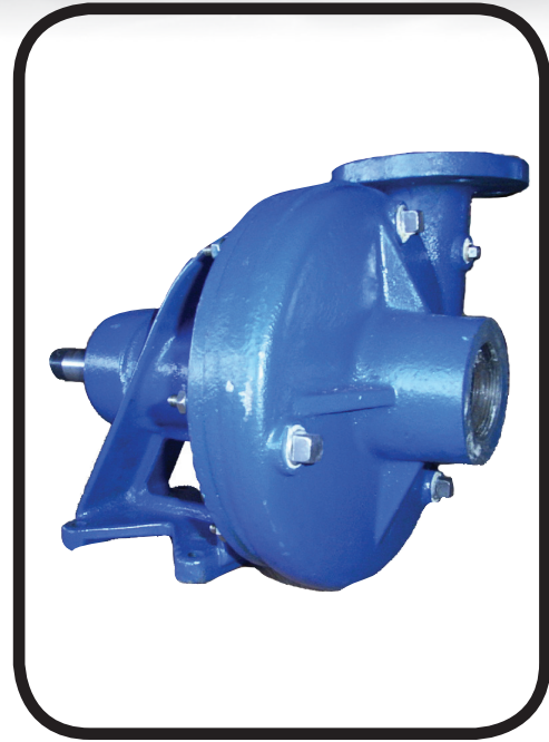
End Suction 2" Suction x 2" Discharge Universal Drive