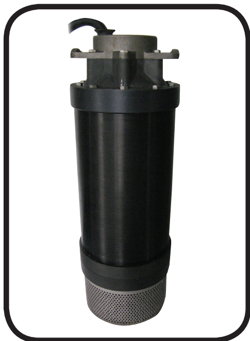
Submersible Dewatering 6" NPT Female