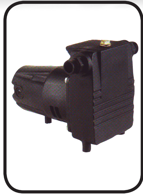
Utility Pump 3/4" Inlet/Outlet, Garden Hose Connection