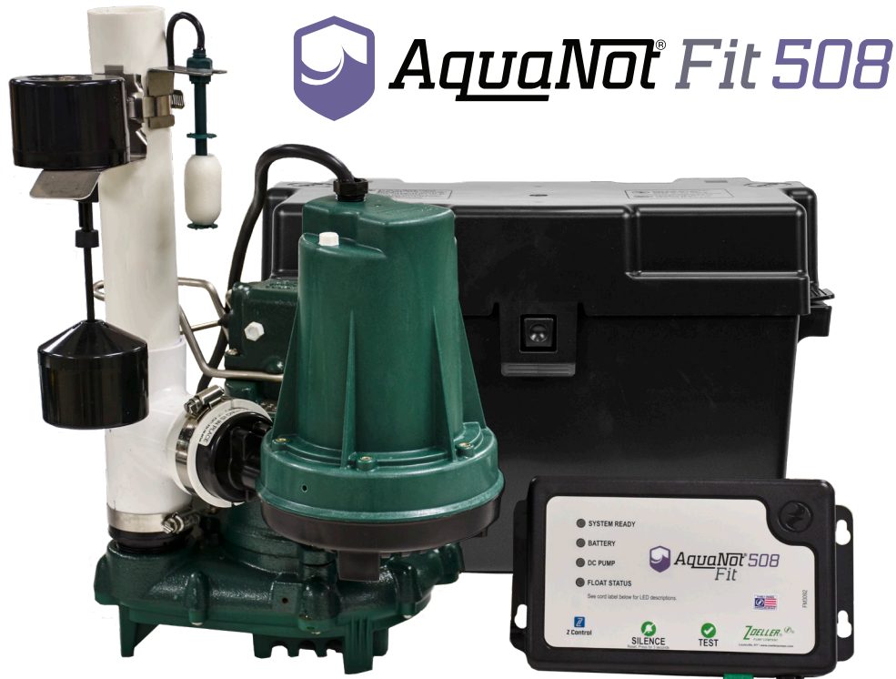
ProPak 508-0015 shown