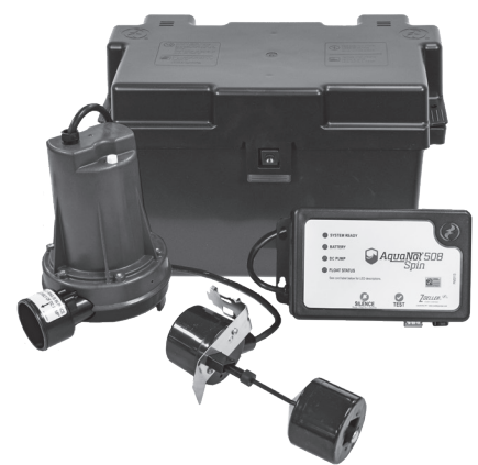
Aquanot® Spin 508 system