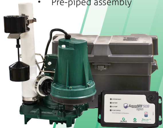
ProPak 508-0006 shown